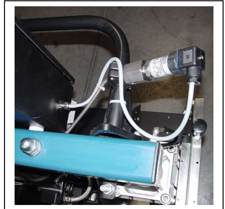
Pressure control adaptor